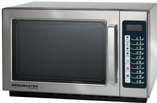
Model RCS511TS shown